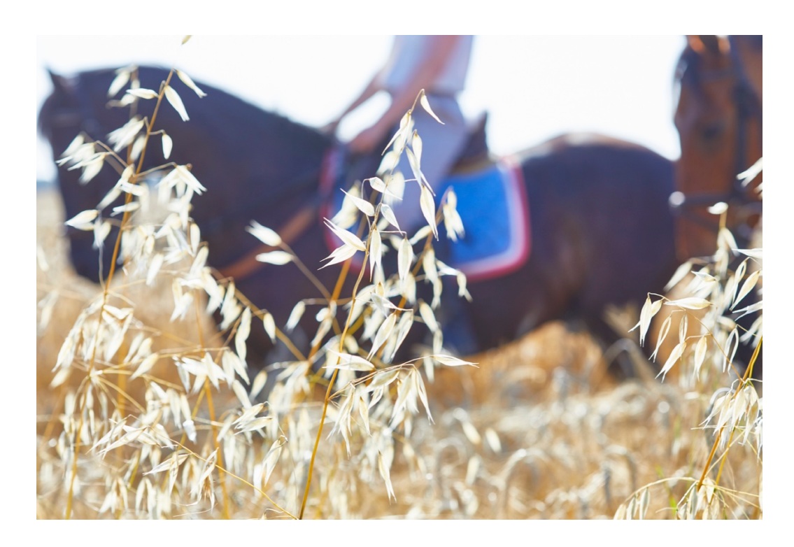
Day 4 - Sunday 28<sup>th</sup> September - Day at leisure / horse riding / hiking / massages / yoga / departure

Host – Your host / chaperone for the day will be Gerry Corbett