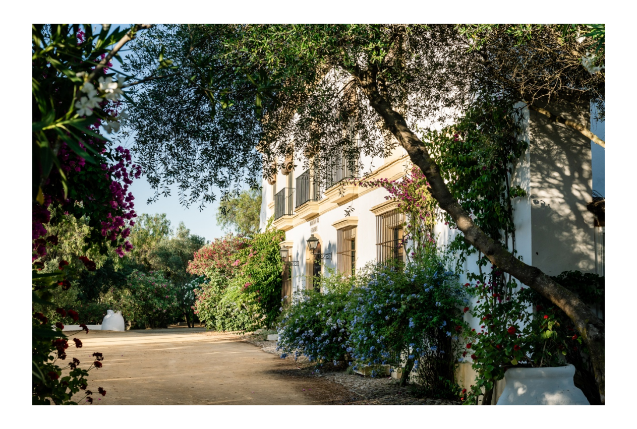
Day 1 - Thursday 25<sup>th</sup> September - Arrival day / Seville / Palacio Bailen / Hacienda de San Rafael

TBC – Seville airport – Flight from Athens – You will be met by team & driver and transferred to Seville in a VIP new modern and comfortable 55-seat Mercedes bus and Ithe uggage will be delivered to the Hacienda de San Rafael (all tagged) in a separate vehicle. The emergency number is +34 620860296 (Anthony Reid the owner of Hacienda de San Rafael).