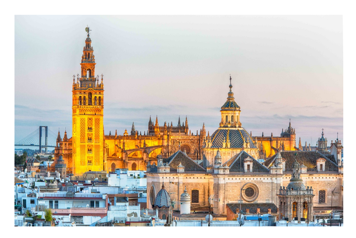
Day 3 – Saturday 27<sup>th</sup> September – Sevilla / Historical tour of Seville / Exclusive use of Palacio las Dueñas / Tapas in Casa Roman / Celebration / Hacienda de San Rafael

Overnight - Hacienda de San Rafael on an exclusive use basis